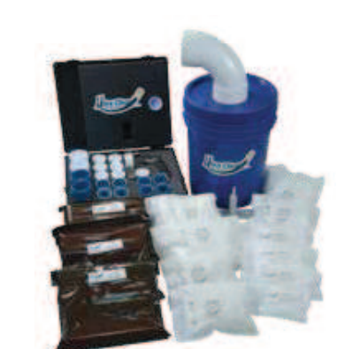
Great starter kit for applications up to 2" ID!